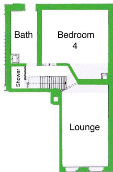
Upper floor (3rd floor above ground)